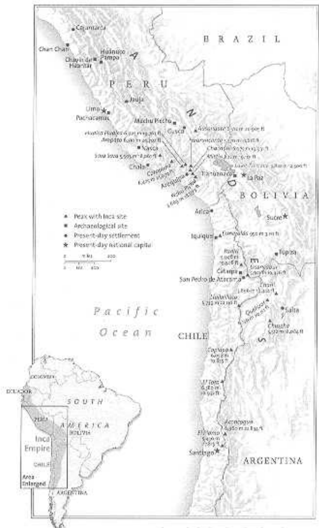
Fig. 1 - Map showing the extent of the Inca Empire in 1532 A.D., with selected Inca high-altitude sites noted. Quehuar is located near the city of Salta in northwestern Argentina (National Geographic Society in Reinhard, 2005).

Mount Quehuar (Quewar, Queva) (6,130 m/20,111 feet) is located in the high-altitude plateau ( puna ) of northwest Argentina (24°19' S, 66°44' W). It is a dormant volcano that is seasonally snow-covered and contains a small glacier inside its crater. Near the highest point of its summit are two unusual Inca ceremonial structures, and one of them represents what may be the only example of an Inca stepped platform ( ushnu ) at a high-altitude ceremonial site. Quehuar is also one of the few mountains on which the frozen remains of an Inca human sacrifice have been found.