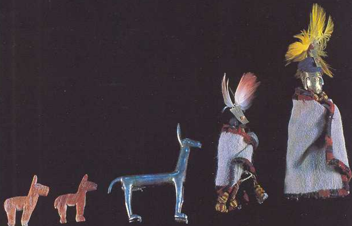
Among the many precious finds on Mt. Lullai-laco in 1999 were llama figurines and two male figures made from Spondylus shell and gold and silver, all placed in a row – a symbolic caravan.